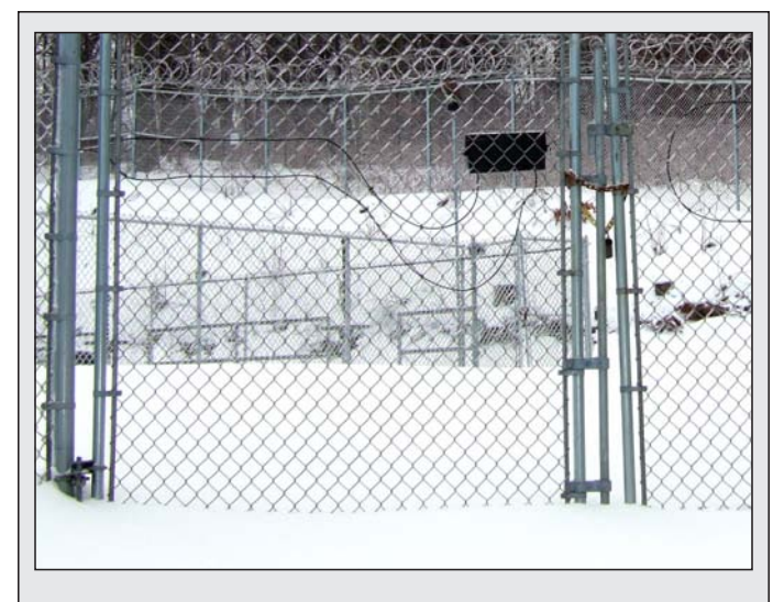
Being able to affix the INTREPID ^{\text{TM}} sensor to existing fencing translated into significant cost savings for The York Water Company.

Given the vulnerability of water utilities, the York Water Company understands that threats will continue to be an issue, and that their facility will be subject to new risks. In addition to testing the INTREPID MicroPoint Cable system weekly to make sure everything is functioning at peak performance, Barefoot explains that it is also